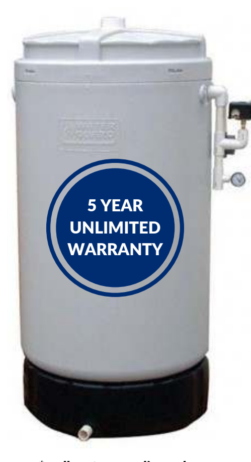
*well water supplies only

Removes unpleasant gases/odors from your water